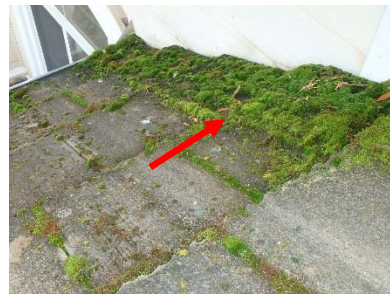
Example - Moss Growth