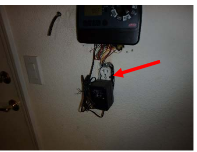
Right Side Garage Wall

[NOTE] Unknown switch purpose detected at the rear door. Middle switch. Unused circuit at the exterior? Refer to seller.