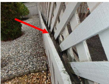
Example - Loose Fencing Slats