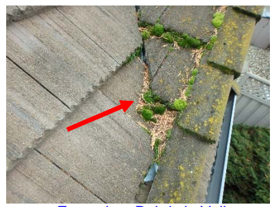
Example - Debris in Valley

[MRR] Inspection of the roof covering revealed the following conditions: There are two tiles which were adhered together at the top left section of the roof. One tile should have been trimmed to fit around the top of the ridge and a cut tile should have been installed at one end of this row/course. This was probably a result of poor planning by the roof installer. The sealant used to join these tiles together is cracked. Sealant should not be used here, as it is prone to crack when exposed to sunlight. A piece of malleable flashing should correct this. Excessive moss growth was observed at several areas. Debris and moss growth observed in roof valleys, atop the roof covering and in the gutters. A section at the rear of the roof, where the wall extends out, is difficult to make weathertight. Care and attention to detail is required here to prevent water from getting beneath the roofing paper. Presumably, this is the reason the roof sheathing was replaced in this area. While a new piece of roofing paper was installed above the repair area, there is still deteriorated roofing paper above this area, where water can get to the roof sheathing. These conditions can result in a roof leak. Roofing Contractor.