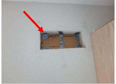
Right Side Wall in Garage

[NOTE] Remove the cardboard panels at the ventilation openings in the garage. Fuel burning appliances in the garage require fresh air.