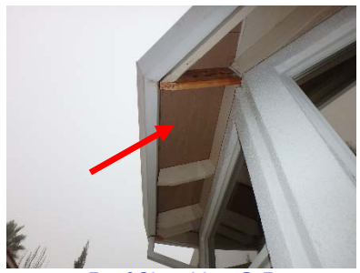
Roof Sheathing @ Rear