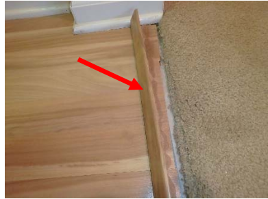
Loose Threshold Piece

[HSC] The electric garage door opener safety reversal system should reverse the door after 15 lbs. of resistance is encountered. The garage door did not reverse with more than 15lbs of pressure exerted on the door as it was closing. This is an unsafe condition. Overhead Door Contractor.