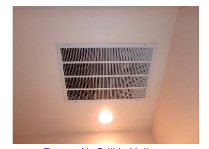
Return Air Grill in Hallway

[MRR] The air filter is located at the base of the furnace cabinet. The furnace is not designed to house the air filter here, as it is loose-fitting and will not filter all the air. Presumably, the air filter was once installed at the return air grill in the hallway. You can see that a different return air grill was installed, one without an openable cover. Presumably, the person who had this done, wanted to access the air filter from a location that didn't require the use of a ladder. If you'd like to keep the air filter located inside the furnace cabinet, have an HVAC contractor devise a means to keep it securely in place, so all the air gets filtered and prevents the evaporator coil and fan motor from getting dirty. Or, you can have an HVAC contractor install a return air grill in the hallway ceiling, which will accommodate an air filter.