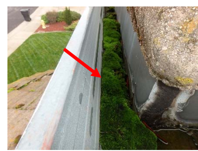
Example - Debris in Gutter