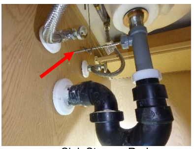
Sink Stopper Rod