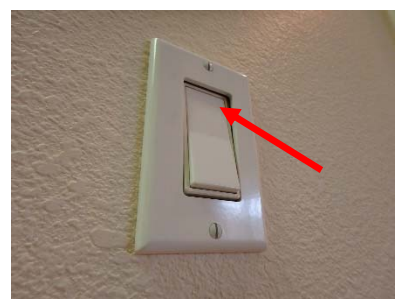
Example - One Kitchen Light Switch