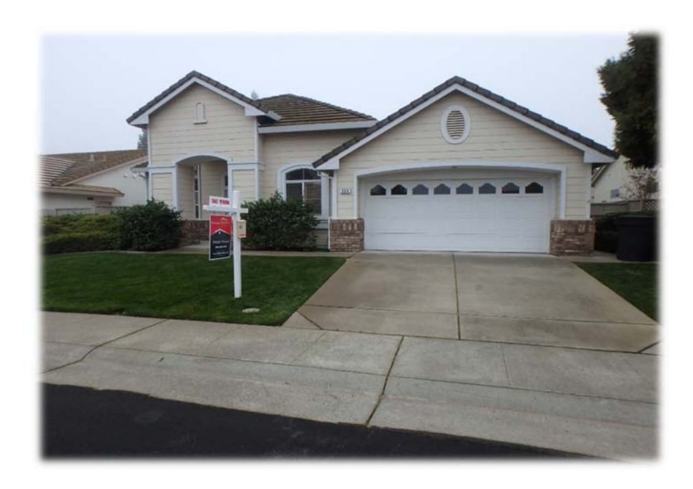
3430 Canyon Oaks Ct Santa Cruz, CA

Prepared Exclusively for: Eddie Haskell Inspection Performed on 01/15/24