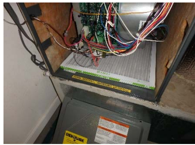
Air Filter Inside Furnace Cabinet