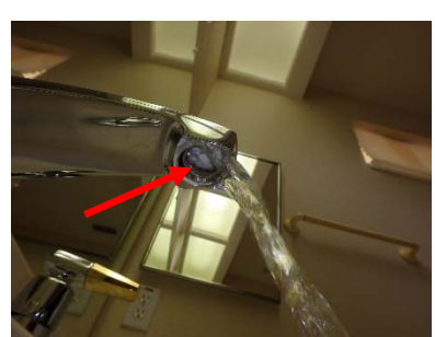
Example - Missing Aerator