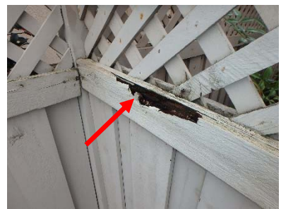
Example – Deteriorated Fencing

[MRR] The right-side gate latch arm is loose and the gate drags the ground. Fencing at several areas around the rear yard is loose and deteriorated. Budget for repairs and future maintenance. Fence Contractor.