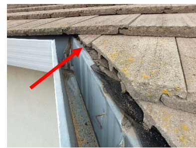
Deteriorated Roofing Paper